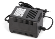
AC24V/3A Power Supply